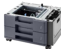
PF-5130 universal cassettes (2 x 500 sheet)