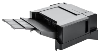
DF-5100 internal finisher (300 sheet), stapling (50 sheet)