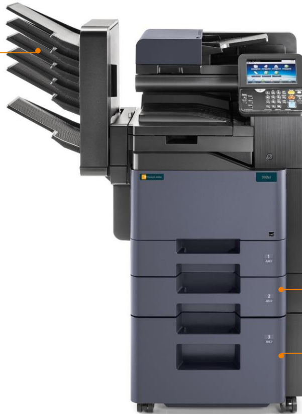
PF-5120 universal cassette (500 sheet), required for installation of PF-5130 and PF-5140